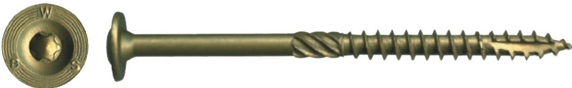
Figure 1. Big Timber® CTX Construction Lag Screw